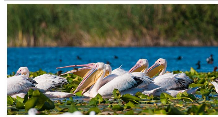
Danube Delta - Pelicans